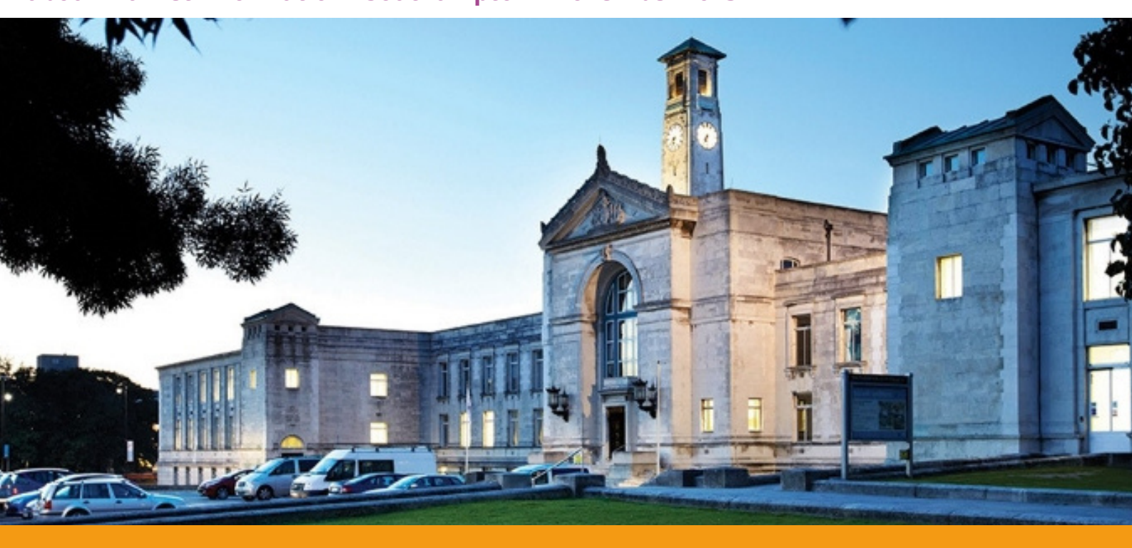
Labour Market Information - Southampton - November 2023